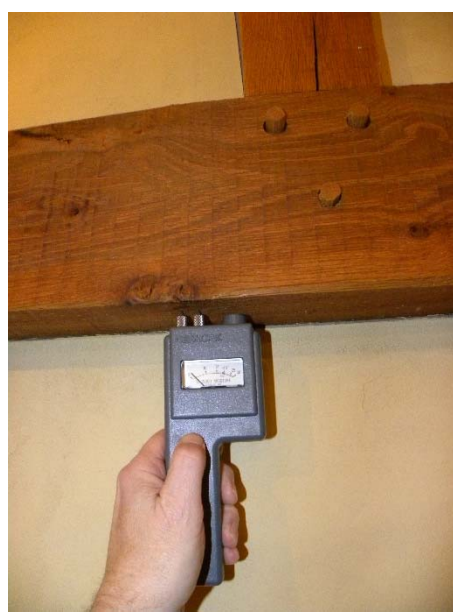
Figure 1 Hand-held resistance-type moisture meter with short pins inserted into the timber measures the MC near the surface of the timber

To take advantage of possible increases in strength and apply the increase to the allowable design stresses, the MC of the timber must be known. The true MC of wood can be determined only by oven drying a sample. However, portable moisture meters using electrical capacitance or electrical conductance can display the approximate moisture content of wood. Capacitancetype meters measure the electrical field within a small area of a piece of wood. They do not require penetration of probes into the wood and generally provide the average moisture content throughout a certain depth, typically less than an inch; however, a wet surface (e.g., rain on a window sill) can dramatically affect the reading. These meters are particularly useful for measuring the moisture content of interior and exterior woodwork (doors, windows, trim, etc.) and dimension lumber.