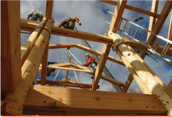
Figure 8: Quartered logs used for columns