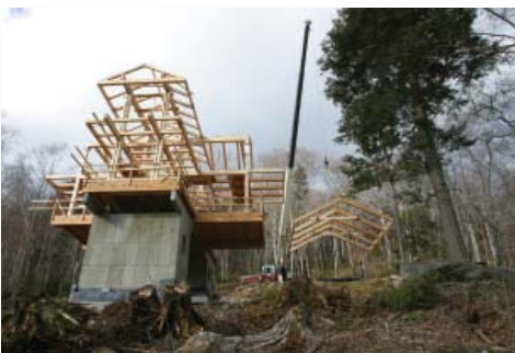
Figure 5: Roof framing has been assembled on the ground

Timber frames are generally raised with a small crew and a crane, much the way a structural steel building is erected. Tapered hardwood pegs are used instead of high-strength bolts and sharp chisels are used for field adjustments rather than cutting torches.