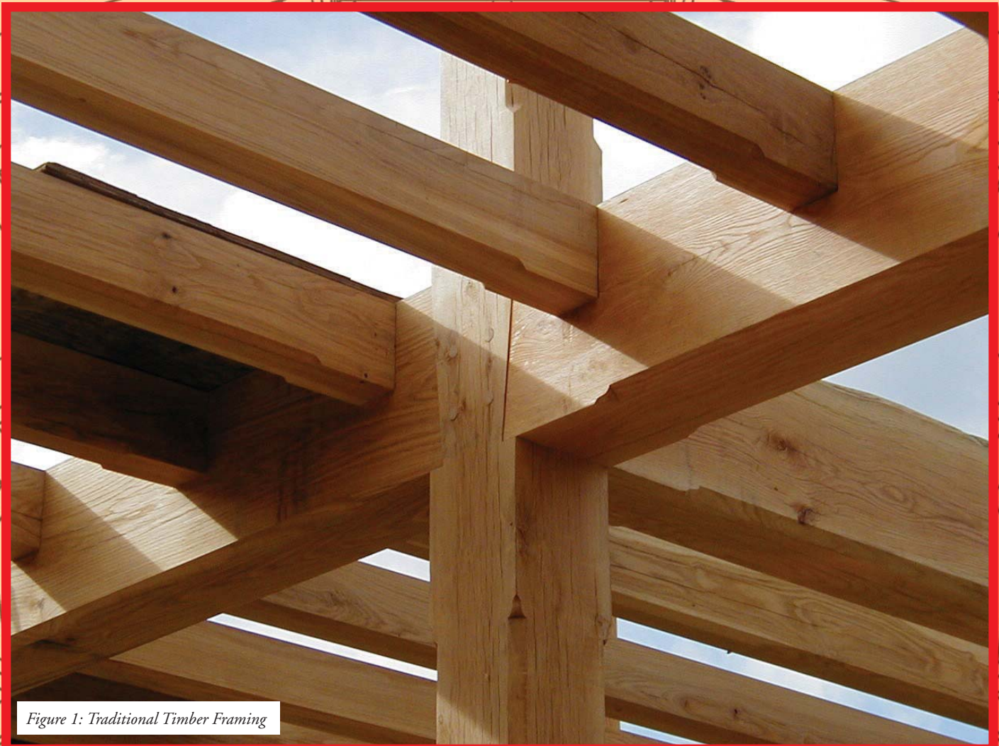
Figure 1: Traditional Timber Framing