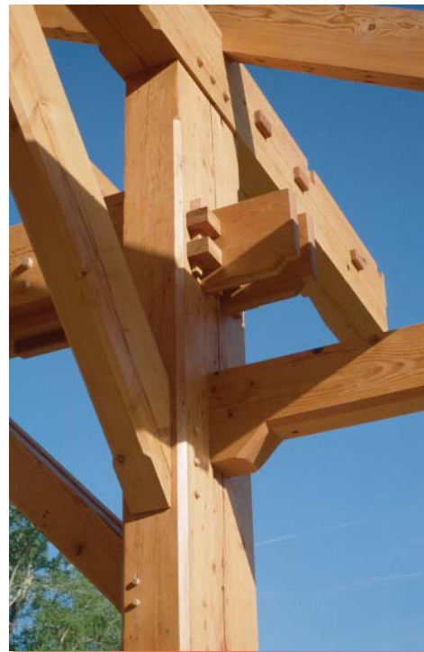
Figure 6: Modern timber joinery

A structure is only as strong as its connections. This is especially true with timber frame structures. The joinery design and detailing is often the most challenging aspect of engineering a timber frame.