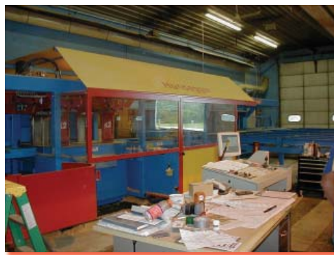
Figure 3: Computer controlled timber cutting machine

In 1989, This Old House ® rebuilt a timber frame barn in Concord, MA on national TV. The demand for timber frame structures exploded almost overnight, and the industry has not been the same since. Timber framing has become a mainstream building technology, and the small backwoods timber framers have grown into large businesses building commercial and public buildings using high-tech design and fabrication methods.