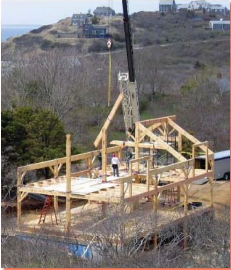
Figure 4: Cranes are used to erect frames

square out housings – although they are likely to be exquisite examples of these ancient tools, carefully made in Japan. In this shrinking world market, American timber framers are also likely to use power chamfer planers made in Spain, stout French chisels, and heavy power planers made in Germany. Carvings, embellishments, and shop finishes are still crafted with hand tools.