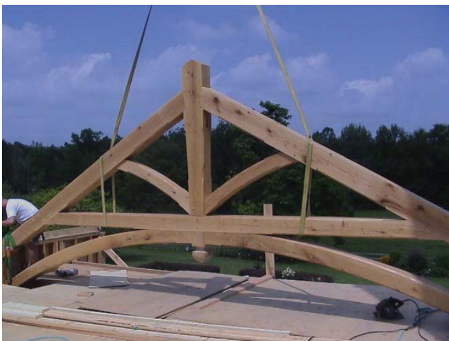
Figure 9: Curved timbers have been cut from larger straight timbers

Solid logs, used as posts, can also be detailed to further stress their natural state by including the trunk swelling at the root ball. This