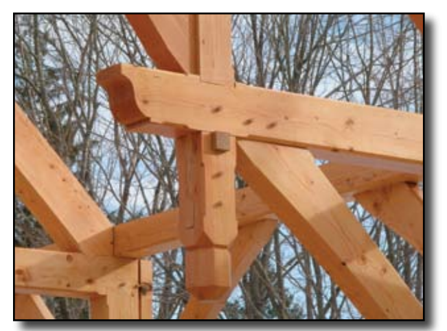
Hammerbeam joint.

The hammerbeam truss is named for the hammer shape formed by a short post that tenons through a beam, much like a wooden handle passing through a wooden mallet. A series of these hammerposts and hammerbeams, propped up by knee braces, corbel from the eave up to the ridge. Much like an arch, all of the members are held in compression under gravity loads. Medieval church roofs relied on massive stone buttresses to resist the outward thrust of the trusses. Such a design would be too expensive and impractical for 21st century Connecticut. Could